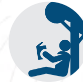
SITTING UNDER TREELIS