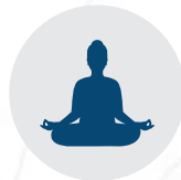
DEDICATED YOGA AREA