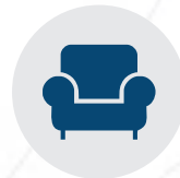
INDOOR SITTING LOUNGE