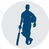
OUTDOOR NET CRICKET