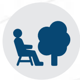
SENIOR CITIZEN SITTING AREA