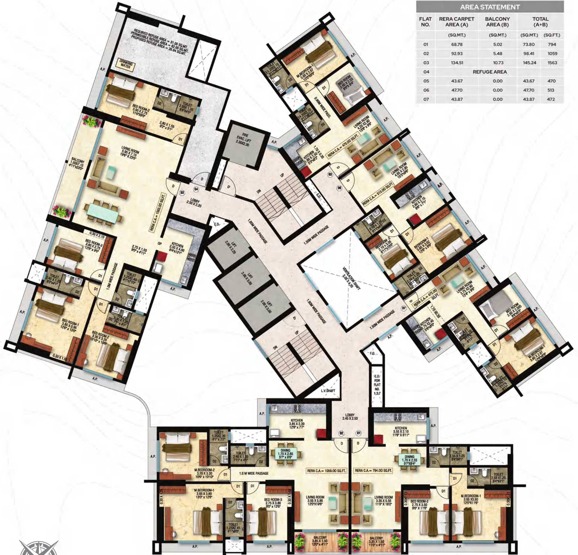
TYPICAL REFUGE FLOOR PLAN (1ST, 5TH, 10TH, 15TH, 20TH, 25TH, 30TH, 35TH)