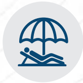
SWIMMING POOL / KIDS POOL

Upgrade your lifestyle with Divine Shloka. Relax and explore luxury every day with endless possibilities. No need to wait for the weekends to have fun.