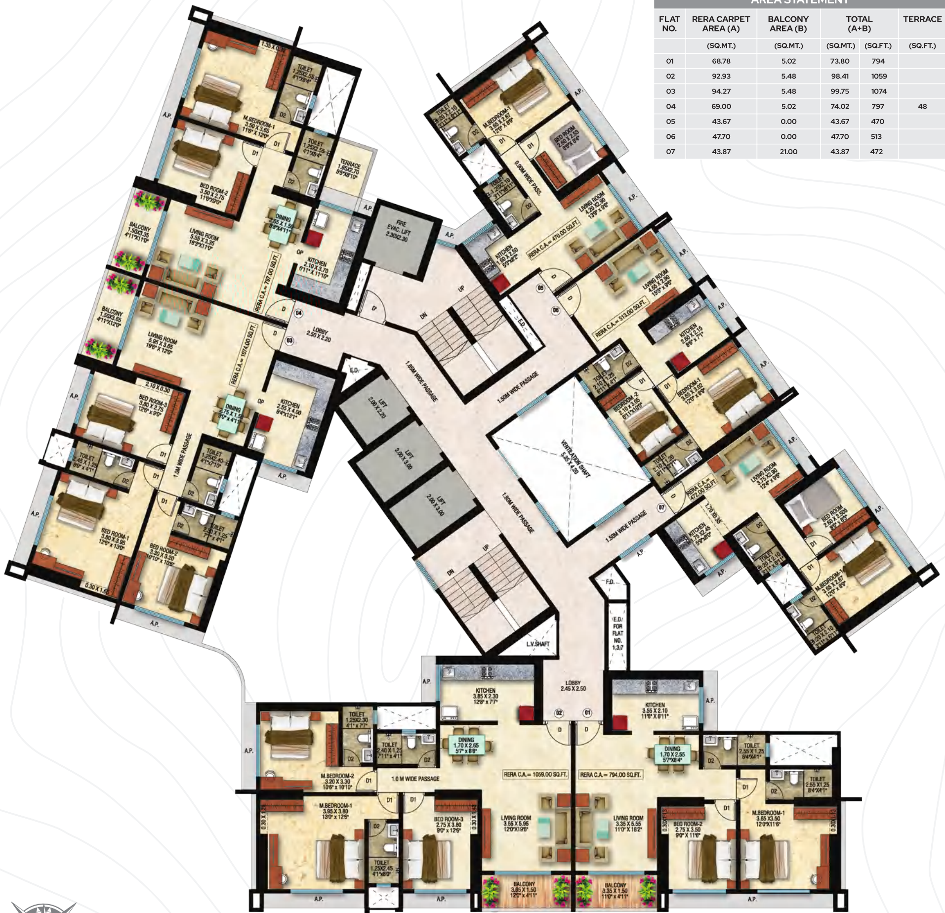
TYPICAL FLOOR PLAN ABOVE REFUGE FLOOR ( 2ND, 6TH, 11TH, 21ST, 26TH, 31ST, 36TH )