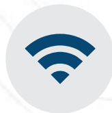
FREE WI-FI & SITTING AREA