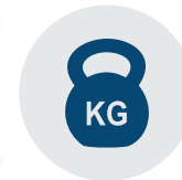
OUTDOOR GYM & INDOOR FITNESS CENTRE