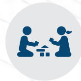
TODDLER'S PLAY AREA