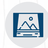
BEAUTIFUL SCENIC VIEW