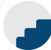
AMPHITHEATRE/ STEPPED SITTING