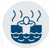
MASSAGE & STEAM ROOM